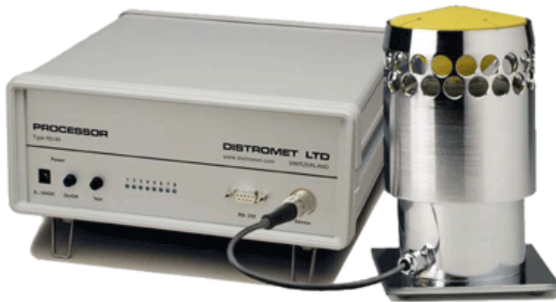
Figure 1. Joss- Waldvogel (J-W) disdrometer signal processor/storage (left) and measuring unit (right).

It was developed because statistically meaningful samples of raindrops could not be measured previously without a prohibitive amount of work. The J-W instrument transforms the vertical momentum of an impacting drop into an electric pulse whose amplitude is a function of the drop diameter. A conventional pulse height analysis yields the size distribution of raindrops in 20 discrete bins. Drop size distribution (DSD) data is typically averaged over a 1 minute period.